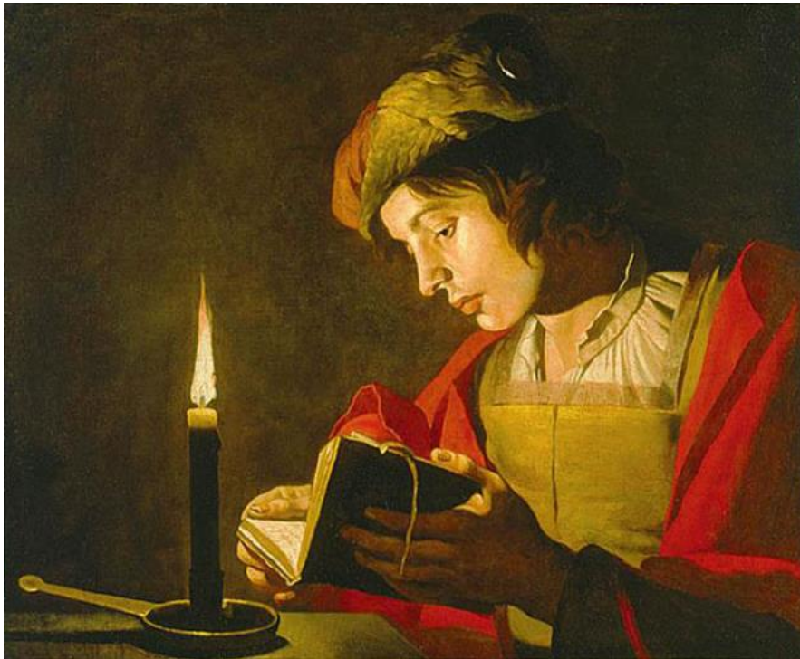
Young Man Reading by Candlelight Artist Matthew Stom (Nationalmuseum, Stockholm).

https://en.m.wikipedia.org/wiki/File:Matthias_stom_young_man_reading_by_candlelight.jpg#file