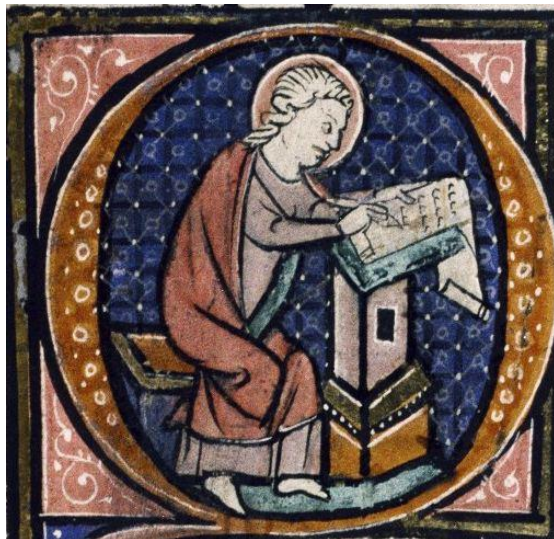
From Li livres dou santé by Aldobrandino of Siena . British Library manuscript Sloane 2435, f. 44v.

Most of these activities were carried out in a scriptorium , a room which was usually kept quiet for better concentration. Large scriptoriums could house about 40 scribes.