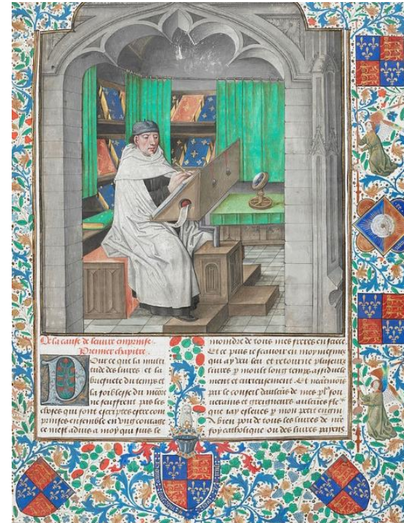
Miniature of Vincent of Beauvais writing in a manuscript of the Speculum Historiale in French, Bruges, c. 1478–1480, British Library Royal 14 E. i, vol. 1, f. 3.